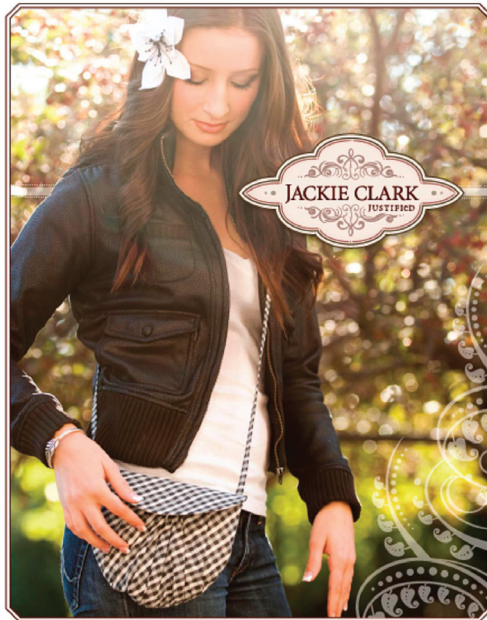
ON THE GO TRIO { HIP PURSE, SCARF & FLOWER }

To Reserve your space: Call 316-684-5855 or visit www.MaterialGirlsQuiltShoppe.com